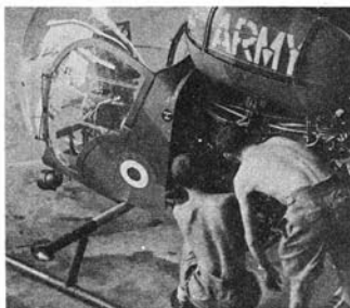
Above: REME mechanics work on a recently assembled Sioux at 57 Aircraft Workshops. They often have to work a 90-hour week.

Unfortunately at the moment there are few regiments with sufficient trained pilots for their air troops or platoons to be exclusively regimental. But with intensive training going on all the time at the Army Air Corps Centre at Middle Wallop, the day is not too far off when every unit will have its own pilots flying its own helicopters.